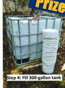
Step 4: Fill 300-gallon tank