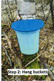
Step 2: Hang buckets