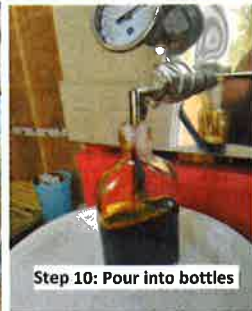
Step 10: Pour into bottles