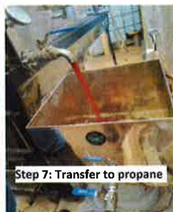
Step 7: Transfer to propane