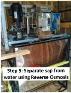
Step 5: Separate sap from water using Reverse Osmosis