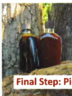
Final Step: Pick logo for syrup