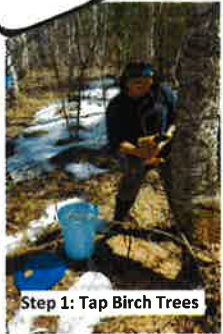
Step 1: Tap Birch Trees