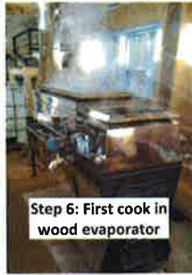
Step 6: First cook in wood evaporator