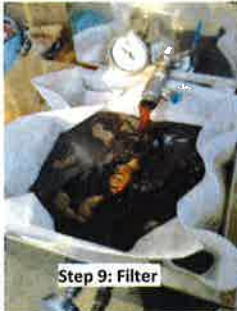
Step 9: Filter