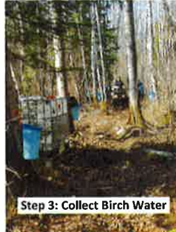
Step 3: Collect Birch Water