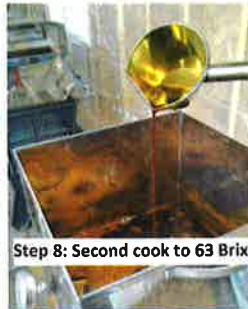
Step 8: Second cook to 63 Brix